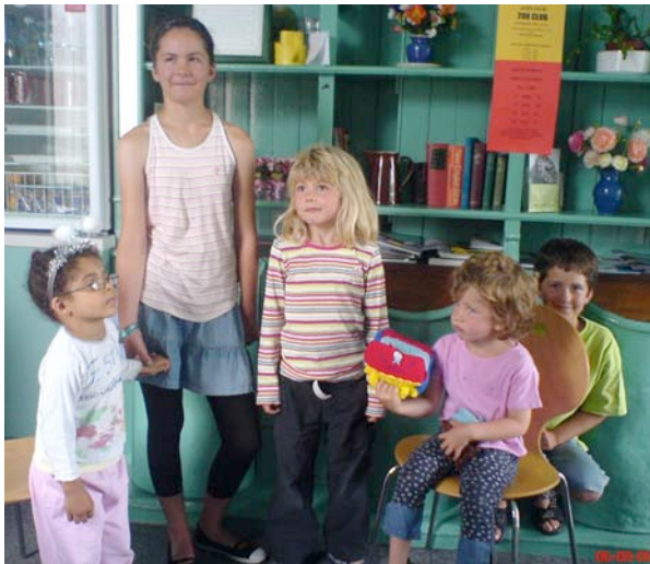
The Graham children 1742 (William Hogarth); the South Edinburgh Quaker children 2008.