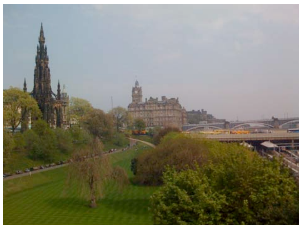
Princes St Gardens before the Festival