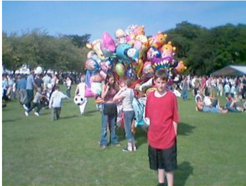
Miniature Festival edition