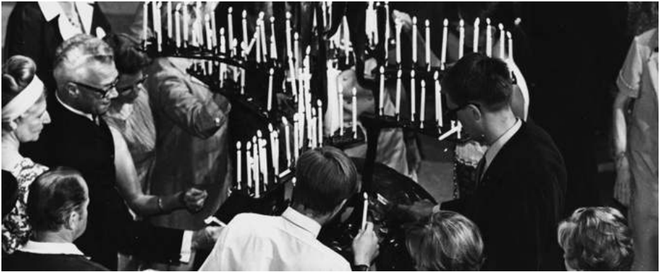
Picture: World Council of Churches laying the foundations of social investor, Oikocredit, 1968

Oikocredit 1968: Leading world-wide social investor is born from the pioneering vision of young WCC members