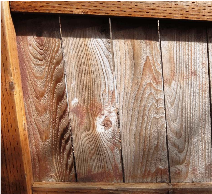
Fence panels in tangential sunshine