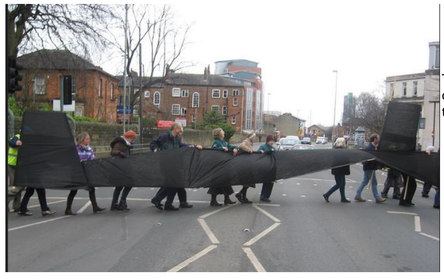
Trident crossing the road