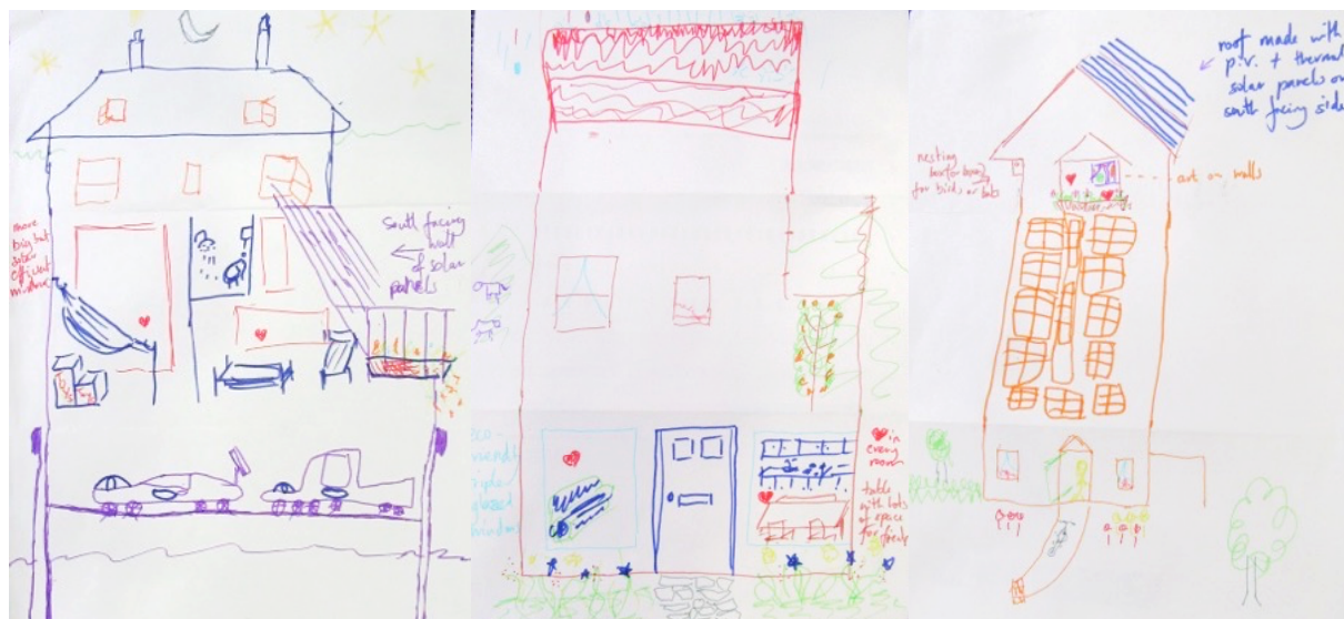
Houses for the future. Sorry text is small: you may need to request explanations