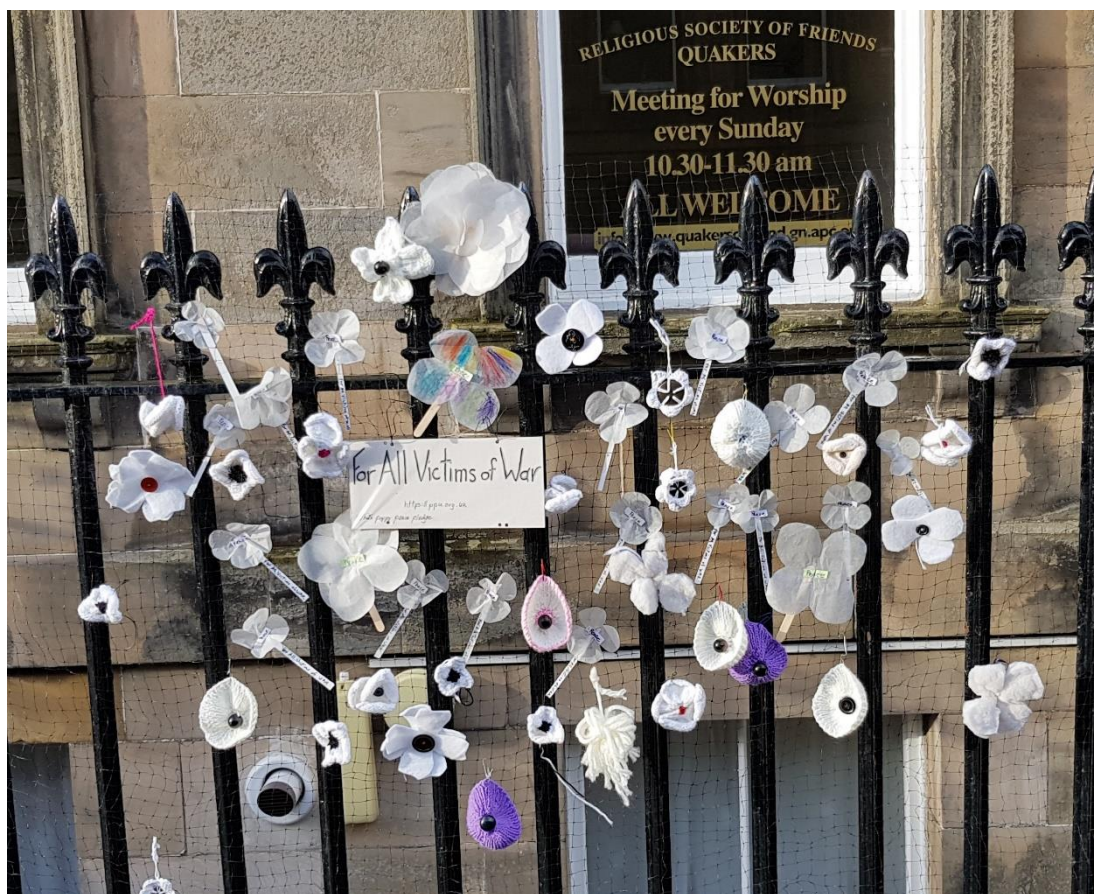
The display of crafted poppies made in St Andrews for the 11th November and which were hung outside the meeting house.