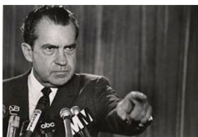
This disgraced former president of the United States

Prize: the usual. Chance of anyone winning it: the usual?