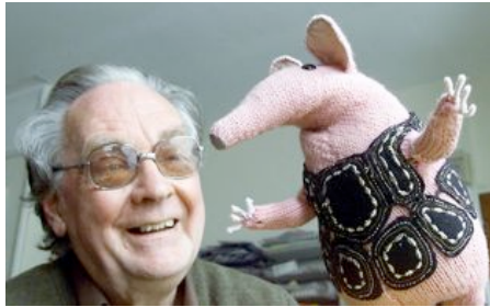
The inventor of the Clangers and Bagpuss