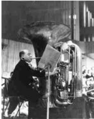
The creator of this Music Festival