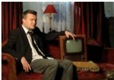
This professional sourpuss TV presenter