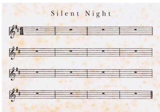
Silent Night (Quaker arrangement) The No. 9 post of 2016 at patheos.com