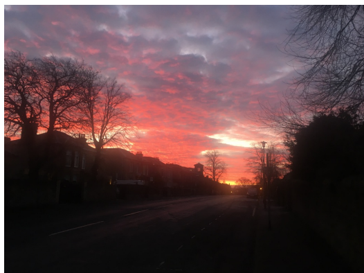
Sunrise over South Edinburgh, 19th Jan