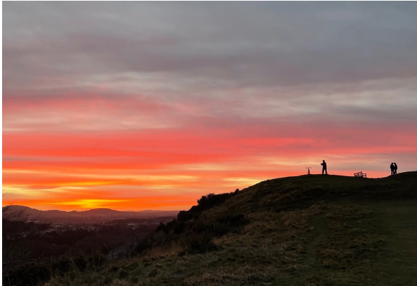
Blackford Hill sunset