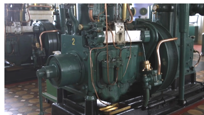
More Victorian geometric tiles in this evocative 3 min film of the restored foghorn at Sumburgh Lighthouse, Shetland. https://youtu.be/iHCmzvzCmhl