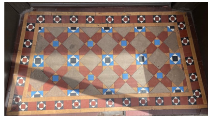
Geometric Victorian tiling in a Morningside barber’s doorway.

Book Group – will meet on 4th Sunday, 27 Feb after Central MfW to discuss The Glass House by Hadley Freeman, and Daisy Miller by Henry James (only 63 pages).