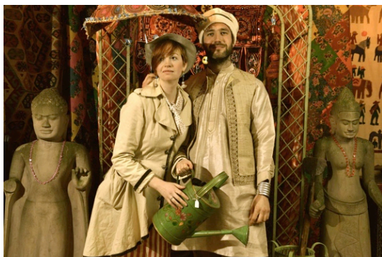
Valentine's Day fancy dress at the Nomad's Tent