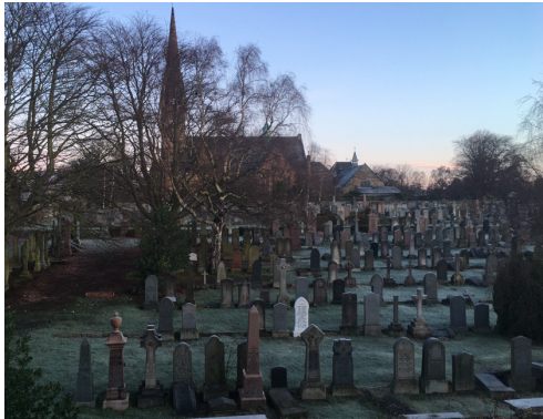
Coimetrophilia – a fondness for graveyards (pointed out by @howardhawks on Twitter)