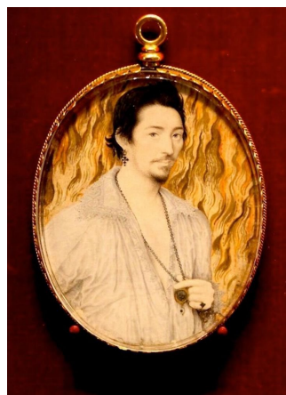
Amid the flames, whose image in his locket for Valentines Day? By Nicholas Hilliard (1547-1619)

Book Group – usually 4th Sundays at 12.15 after Central MfW. Note CHANGED FOR JANUARY to 29th ( The Valley at the Centre of the World by Malachy Tallack). February book to be decided. You could suggest one.