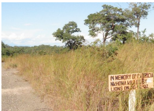
Other people's worries. Also see page 3.