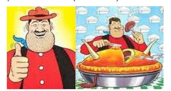
(Dandy - now online only)

Our Facebook Page of the Month also serves as 'What we're reading' this month, as it is desperate.dan.1232 (964 friends)