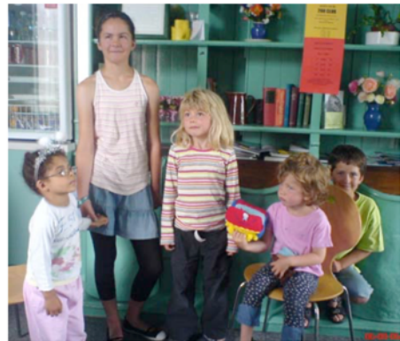
The Graham children 1742 (William Hogarth); the South Edinburgh Quaker children 2008.