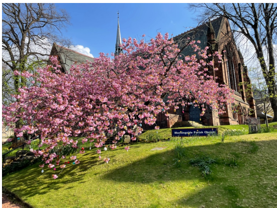
Our neighbours have upped their yarn game.

Peace at the Heart – a relational approach to education in British schools . This report is due to be released by BYM on 11 May but you can read or watch the case being made for it on the BYM website at https://bit.ly/3CTrEa