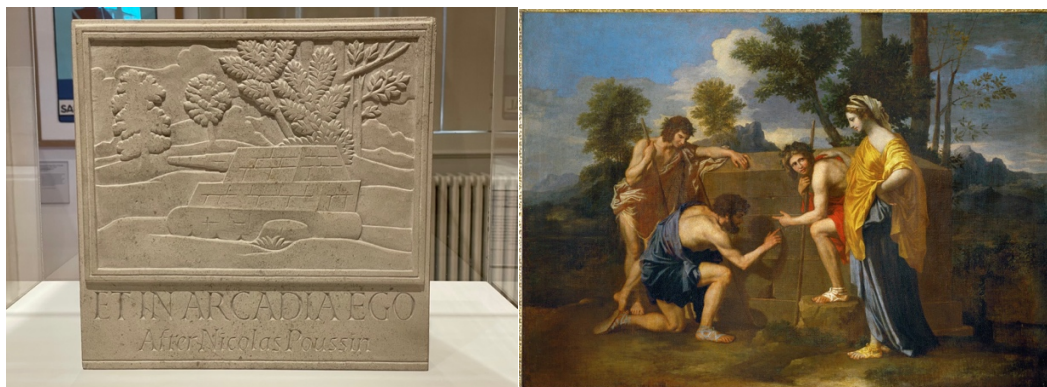
Et in arcadia ego (I too was in Arcadia) by Finlay 1976, Poussin 1627.

The classic English Country Garden, often described as Arcadian, was modelled on the the dreamy imaginary landscapes of Poussin, with classical architectural features and characters, or shepherds/milkmaids set in beautiful but artificial scenes, with picturesque clumps of trees and surprise vistas. An exclusive and competitive feature of 18th century wealthy estates.