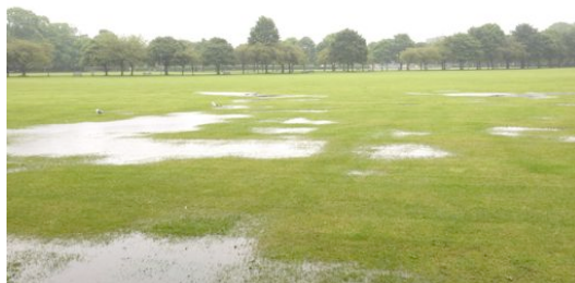
Ducks swimming on the re-forming South Loch

Your selections here: Items up to 50 words on your latest Soap, book, film, favourite ad for hair products. neilturn by gmail/ fbk/ Siri/ toss of the head.