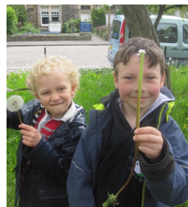
Study with dandelions