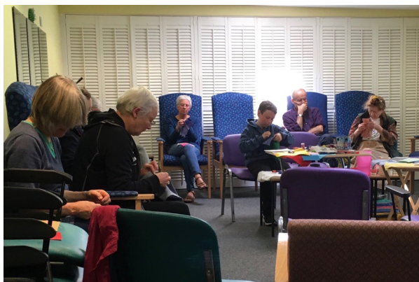
All-age meeting, June 2019