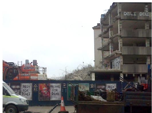
Farewell to Shrubhill Social Work Dept.