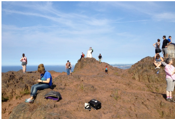
The top of Edinburgh