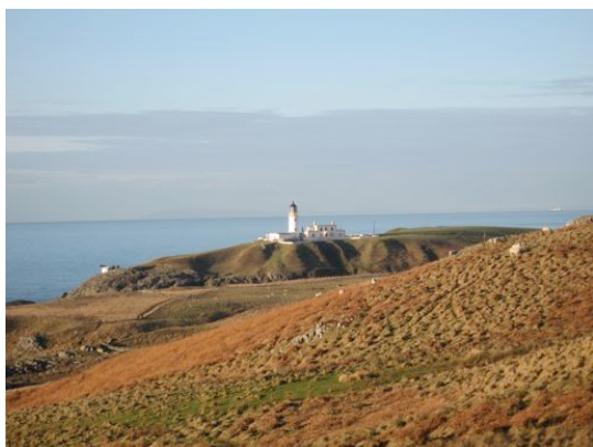
Mull of Galloway lighthouse