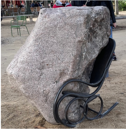
Alicja Kwade, Stella Sella . https://bit.ly/3QfTynF (audio)