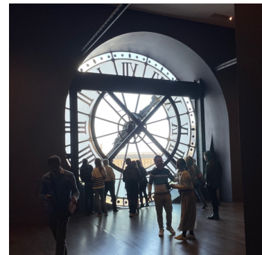
The clocks went back

Our newsletter is published near the last Sunday of each month. Noeltide novelties to neiltun@gmail.com Find this edition, plus archives of previous, at www.quakerscotland.org/south-edinburgh