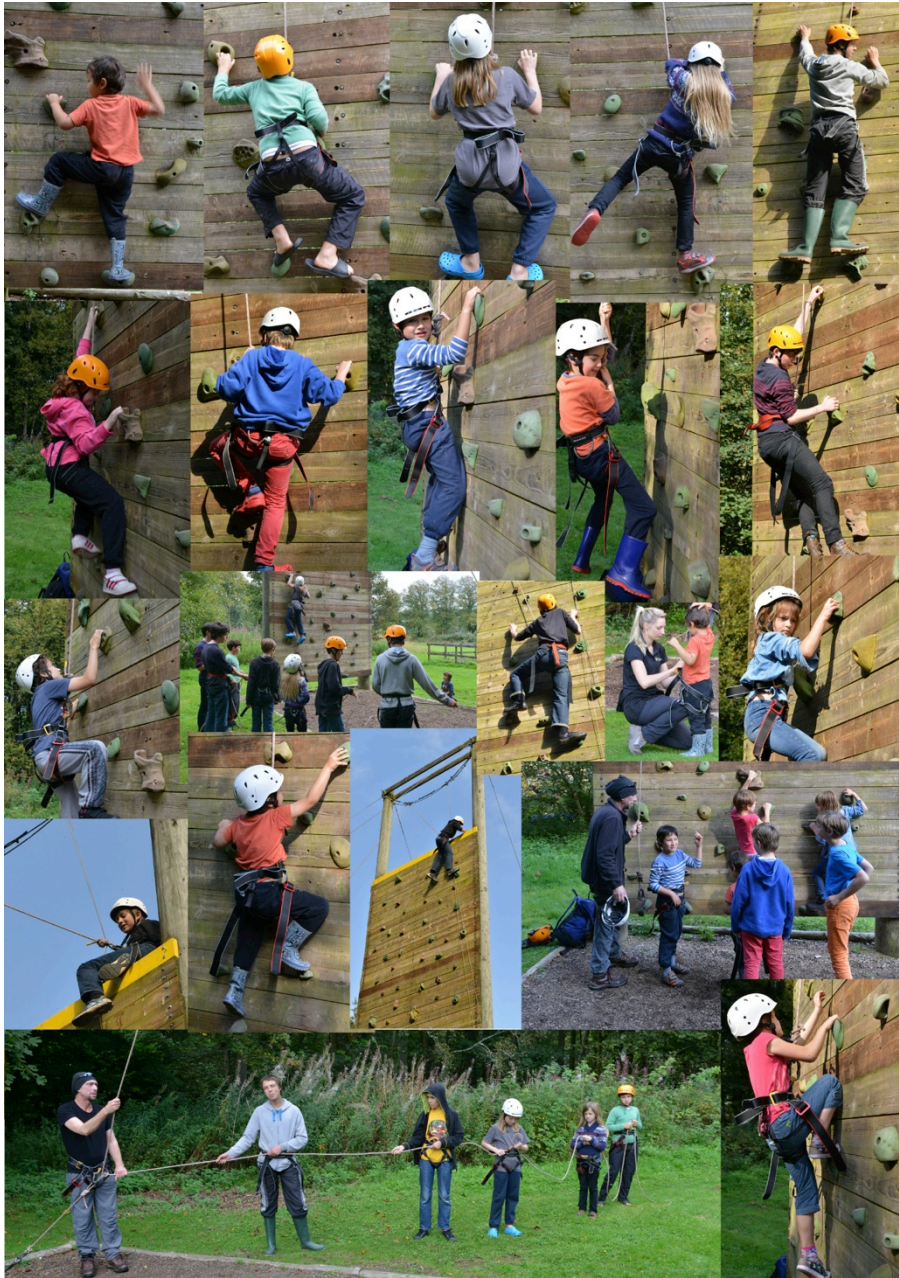
Up The Wall: our young people's activity this year at Wiston Photos and montage: Rufus Reade