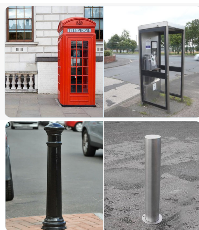
Evolution of the phone box and of the bollard

The dangers of minimalism from our Twitter account of the month , @culturaltutor (355,200 followers). https://bit.ly/3Vw7USz But don't miss the scores of other topics, including lots of beautiful art. Or there is a library of threads at https://culturaltutor.com/the-library