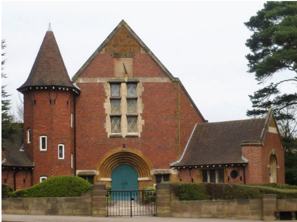
Bournville Meeting House

I came away thinking that perhaps instead of ‘town twinning’, we now need ‘climate change twinning’ to allow us insight into how local communities can support each other internationally through dialogue and local action. ■