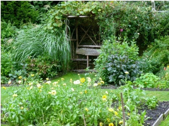
A quiet corner, Woodbrooke