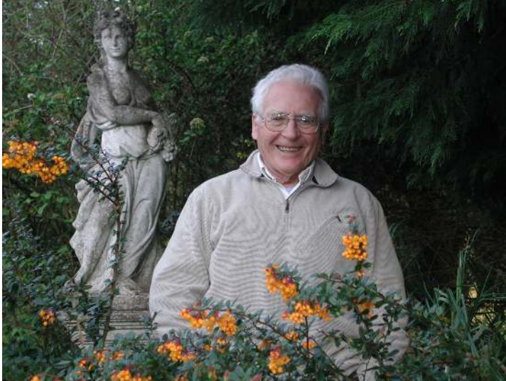
Photograph 2: James Lovelock in 2005.

Perhaps once in a generation somebody comes up with an idea that is so huge it changes the whole way we understand our planet. For me and my generation I believe it was James Lovelock, inventor (his term) of the Gaia Hypothesis, which compares Earth with a giant, self-regulating, super-organism, sustaining life in homeostatic equilibrium.