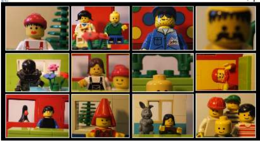
Photograph 5: Lego Zoom Meeting.

Friends, I am 85 years old, no longer quite so active as I was, and living on a croft just off the north-western edge of Scotland. So, I'm aware that I am not perhaps a typical Quaker. I know that I shall never again get to on Area Meeting in person, let alone the General Meeting.