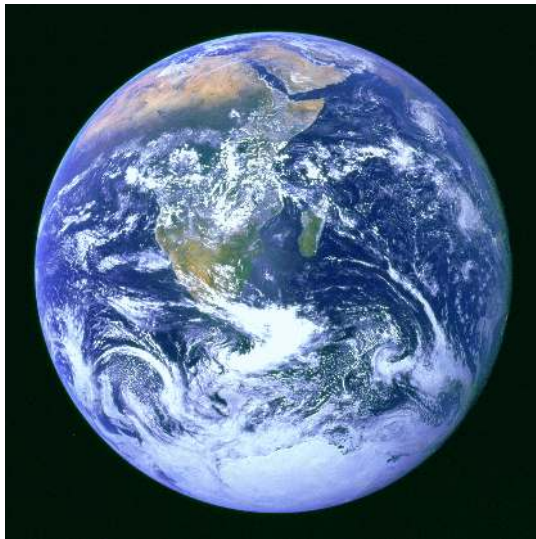
Photograph 4

Unsurprisingly Lovelock was in the vanguard of scientists and thinkers who called for a limit on the emission greenhouse gases that are creating climate change. His 2006 The Revenge of Gaia provides a dystopian view of the environmental catastrophe our planet is facing based on sound science rather than fear. Now, 16 years after its publication, comprehension of climate change may have become mainstream within the scientific community, we are no closer, it appears, to finding the solution that will prevent the collapse of our civil existence. In berating our hubris Lovelock said 'We are just glimpsing the possibility that the worship of humankind can also become a bleak philosophy, which excludes all other living things, our partners in life upon Earth. The bee is not complete without the hive; all living things need the material Earth. Together with the earth, we are one with Gaia' 3 .