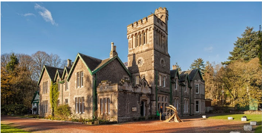
Photograph 6: Wiston Lodge

Please make payment to Tinto Music and Arts CIC [Sort Code 83-16-11 Acct 00768741] with your last name as Reference OR send your cheque - with attendee name on the back - to Meg Beresford, The Shieling, Wiston Lodge, Millrigg Road, Wiston, near Biggar ML12 6HT. This direct payment means no fees go to internet giants and keeps costs down.