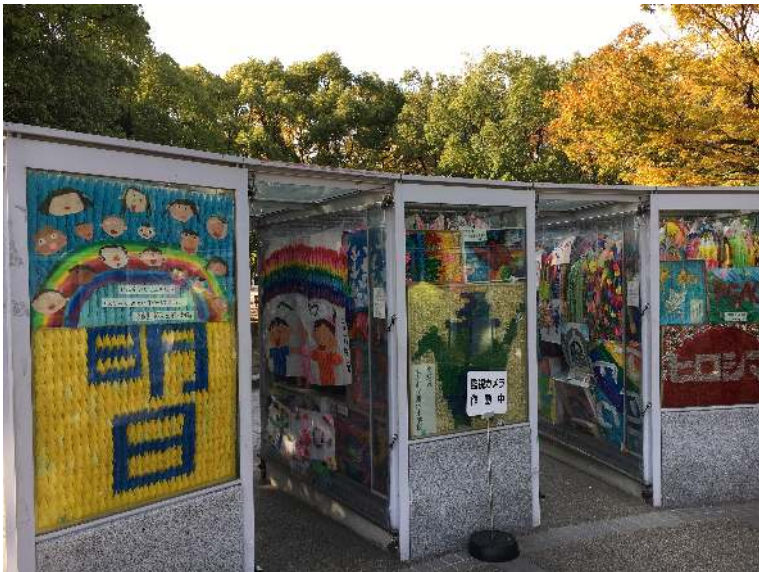
Photograph 1: School projects at Hiroshima's Peace Memorial Park, Japan.