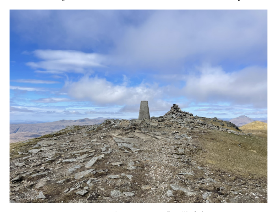
Photograph 4: A trig point on Ben Vorlich.

Today we recognise that we can be a community of transformation as we look to adapt to the change all around us. It won't be easy, and there will be challenging and questioning. But we have each other. We need to think through how we do things, but we have the resource of each other to draw upon".