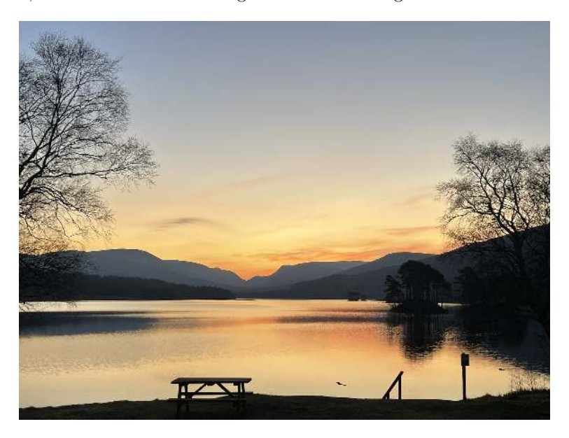
Photograph 11: Sunrise, Loch Ossian.

London Friends have shown that with care and thoughtful planning we can be open and honest with each other on these contentious issues. I hope that we will follow this good example more widely, hopefully with support from Quaker Life, in the spirit of kindness and truth. In the words of the final YM Epistle, "we need to find kinder ground for our disagreements".