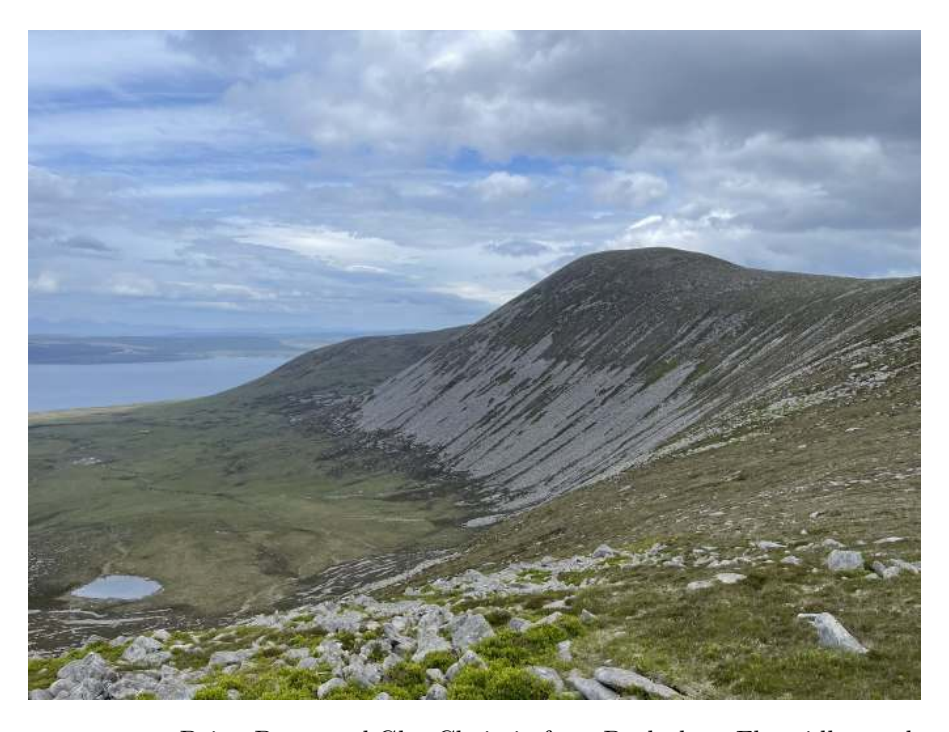
Photograph 8: Beinn Breac and Glas Choirein from Bealach an Fharaidh, north west Arran.