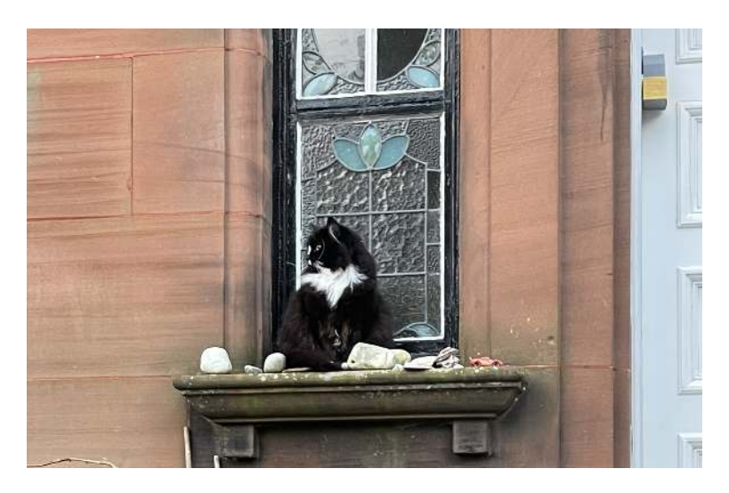
Photograph 9: Somewhere (could be anywhere!) in Hyndland, Glasgow.

To ask about PEWG's work on peacebuilding or to sign up to receive an occasional newsletter providing opportunities for your own political engagement on PEWG's discerned priorities, please email our PEO sarahk@quaker.org.uk