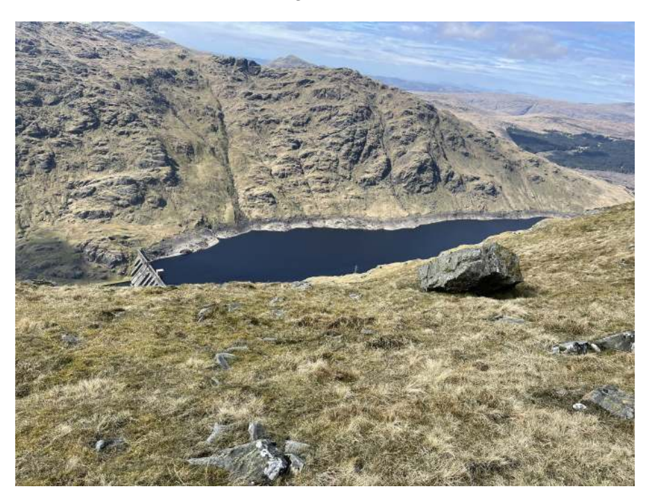
Photograph 3: Loch Sloy.

For those attending GM in person we received generous hospitality from Dundee Friends. It felt like a celebration of cakes! Tempting to think of it as a Marie-Antoinette of Meetings!