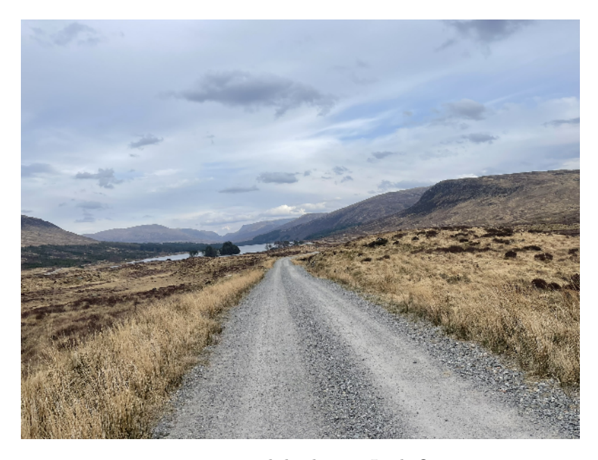
Photograph 5: Track leading to Loch Ossian.