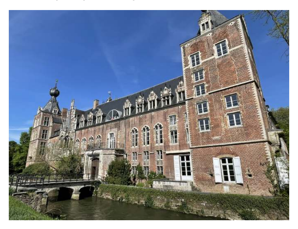
Photograph 6: Arenberg castle, Leuven, Belgium.