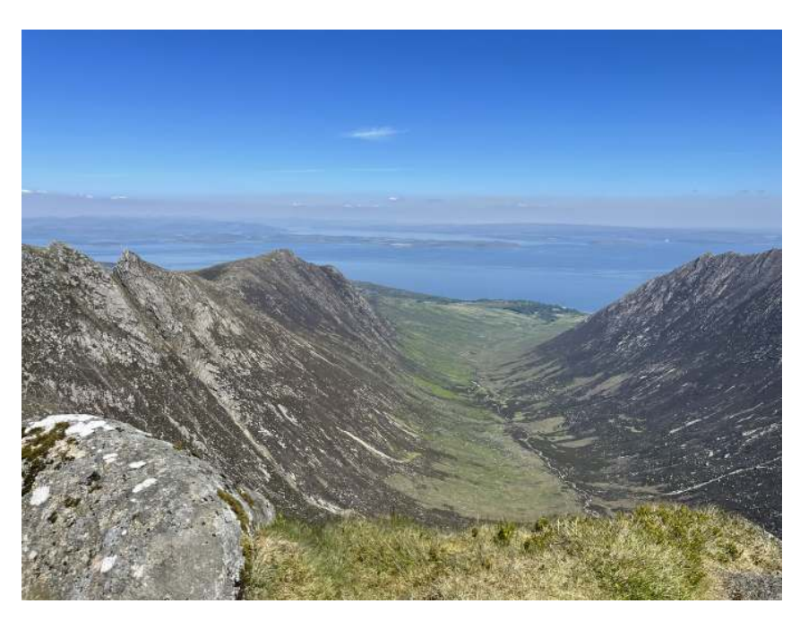
Photograph 1: Glen Sannox from the summit of Cir Mhòr, Arran.