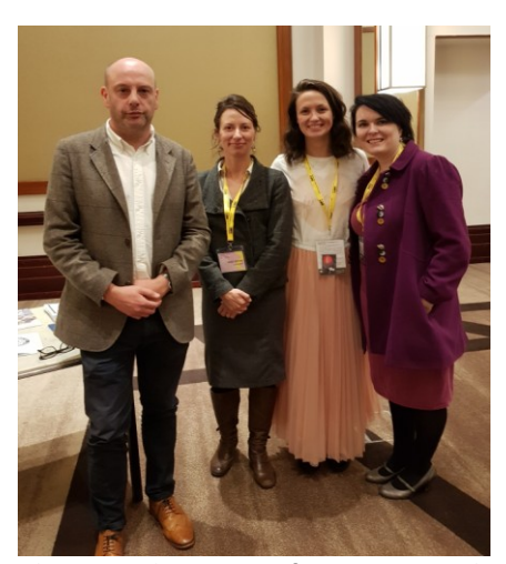
Above: At the SNP conference in October 2017 with Forces Watch, Child Soldiers International and Youth for Independence, at a fringe meeting on raising the age of recruitment.

If your local area meeting would like a talk about political work then please do ask. Usually these are given by members of the Parliamentary Engagement Group, who have been appointed by GMS.