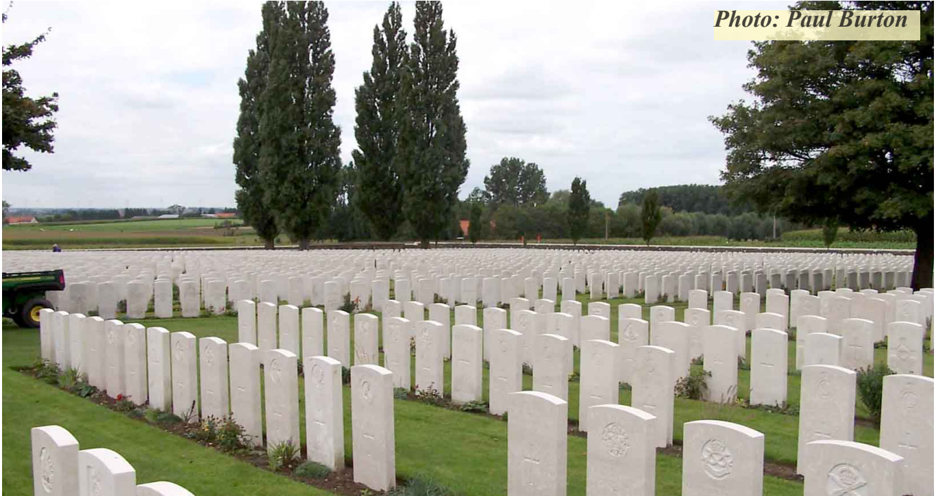
Some of the 11,954 Commonwaelth graves at Tyne Cot. "We can truly say that the whole circuit of the Earth is girdled with the graves of our dead. In the course of my pilgrimage, I have many times asked myself whether there can be more potent advocates of peace upon Earth through the years to come, than this massed multitude of silent witnesses to the desolation of war." — King George V, 1922