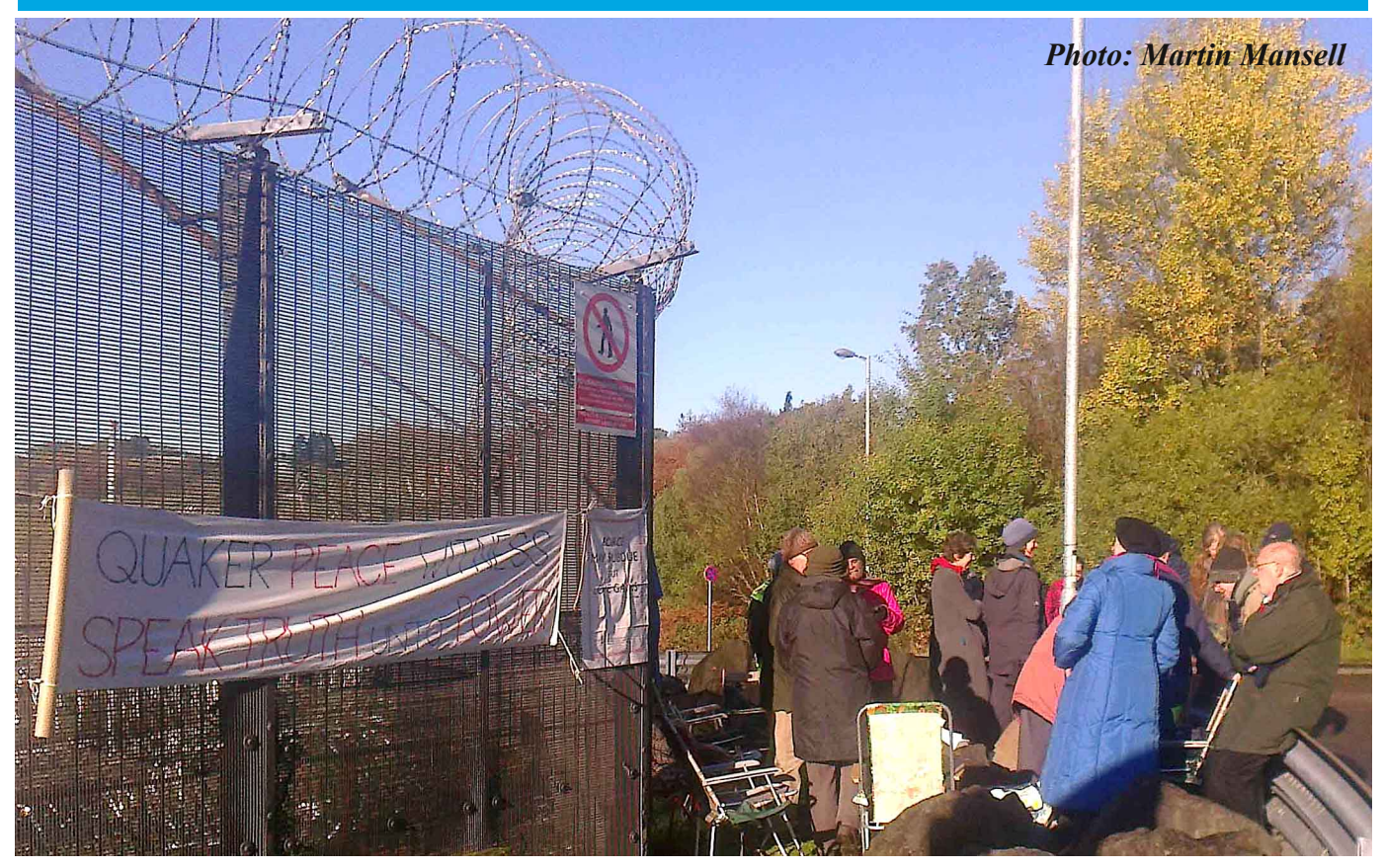
About 30 Friends, including friends from the Peace Camp, met on Rembrance Day in bright sunshine on the verge outside the South Gate to Faslane Trident base. We had our usual visits from (and photographs taken) by the MoD police, but they were quite friendly and almost apologetic to us afterwards.