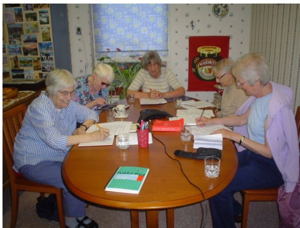
All grannies and all busy on Area Meeting

Wis that the thing that saw ye through? That made ye whit ye were? Wis this yer secret formula, thit people find sae rare? Ah'd love tae meet ye wance again, an' tell ye hoo ah feel, Hoo much ah miss ye Grannie; yer lovin' long-lost chiel.