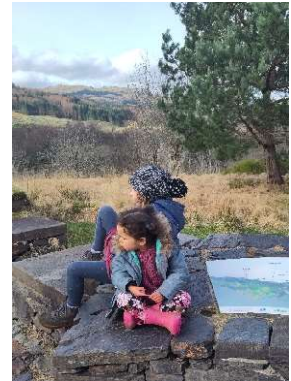
My daughter and one of her new friends at Crianlarich

My youngest daughter and I went to the West Coast Friends Gathering in March. It was an absolute pleasure to reacquaint myself with Friends from the more remote places in the West of Scotland. My daughter made new friends and was delighted to go on our first ever road trip just the two of us.