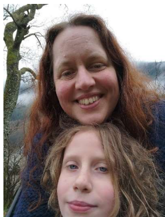
Me and my daughter at Loch Lubnaig

Today I am wearing sandals for the first time. Blossom is on the trees and the bluebells are out. It feels like Spring is beginning to turn into Summer.