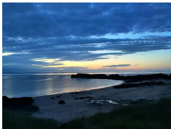
East Lothian coastline on the summer solstice

On the summer solstice I left my house after the children were in bed and walked along the coastline near my house. The light nights are a blessing for someone who occasionally cannot cram a walk into my busy days. Summer solstice is bitter-sweet for me, I know we are sliding towards shorter days and worse weather. I have to remind myself that we have months of summer left. That the summer will come again as sure as the winter. That this is all part of an ever-changing cycle.