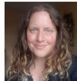
Slightly old picture of me

As the local development worker for Scotland I work to support Scottish Quakers and Scottish Quaker communities. My ongoing work for Quakers and Meetings includes opportunities to support your work and learning: