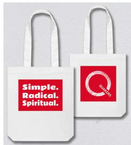
Simple Radical Spiritual tote bags

Quaker Week runs every year to help Quaker meetings to attract new people and share their faith.