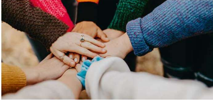
"Should' should never be seen", the Friend, 9 May

I was pleasantly surprised by a compliment from a Friend who congratulated me on my article in the Friend (the Quaker magazine, produced weekly - https://thefriend.org/ ).