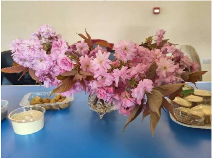
Cherry blossom and shared lunches

I had the lovely experience of visiting Kelso meeting to run a Gifts workshop with the Friends there.