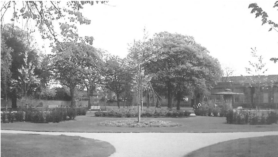
The park opposite Montrose Day Care Centre